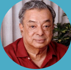
Dr. Verghese Kurien

A newsletter of Anandalaya, Jan-Feb, 2021 : Issue - 15